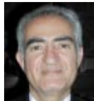
Third award (2002)