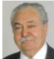
First award (2000)