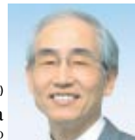
Fourth award (2003)