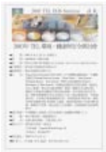
TEL EHS Seminar Pamphlet

General topics covered included TEL's stance on the environment, health and safety, and analysis of various accidents. We also had a special guest speaker from the Japan Institute of Human Factors who used case studies of accidents to explain the mechanism that causes accidents and the relationship with human factors.