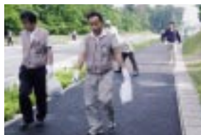
Environmental clean-up activities

In Ozu town in Kumamoto Prefecture, “Ozu environment beautification campaign day” has been set for two days each year. On these days, beautification and landscaping activities are performed. Our Ozu plant has participated in this event since the plant was opened and cleaned places like the Kumamoto Central Industry District. A total of 49 employees from our companies and our suppliers participated in the activities during the first half of 2004.