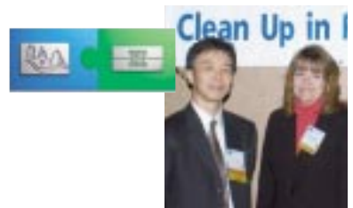
Environmental Campaign Award

Tokyo Electron America (Head Office in Austin, Texas) was awarded the National Citation of Merit in the Keep Texas Beautiful environmental contest in 2003. We have been actively providing many kinds of assistance, such as educational assistance, particularly in science and mathematics, health assistance for needy local residents, and improvements to make the community easier to live in, as well as landscaping and beautification activities. This award was based upon recognition of our assistance in programs in Austin, such as recycling activities at local schools, nature education programs for local residents, road administration by our employees and waste management programs.