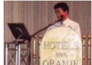
Presentation at ISESH

We explained in detail our efforts through the "development of our gas supply/emission system" by way of an analogy describing the gas supply of our Thermal Processing System TELFORMULA as the upstream of a river and the emissions system as being the downstream of the river.