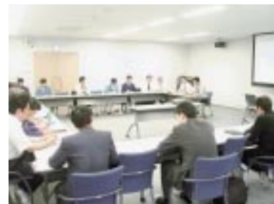
EHS Liaison Conference

TEL employees have always been made aware of the rules and relevant matters to be transmitted at our company through in-house training. However, the establishment of this conference has strengthened the regular exchange of information and encouraged an active exchange of opinions.