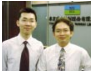
EHS staff of Tokyo Electron Taiwan