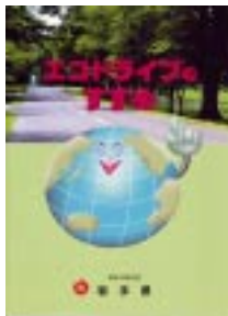
Iwate Prefecture's "Eco-drive Advisory" poster

At our Yamanashi plant, stopping vehicles from idling is company policy. For example, all the cars entering and exiting the plant are encouraged at entrance the security station not to leave their vehicles idling in order to reduce CO 2 emissions and raise awareness about not leaving vehicles idling.