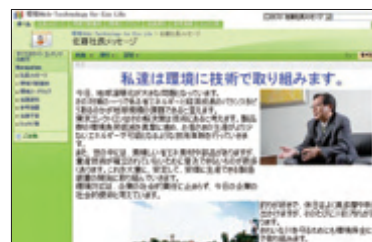
TEL's intranet site

In 2007, we launched the Company intranet to communicate environmental-related information, such as examples of successful related activities within the Group, messages from top management and meeting materials.